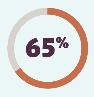
of consumers want to keep using virtual and self-service options to manage their healthcare payments<sup>4</sup>