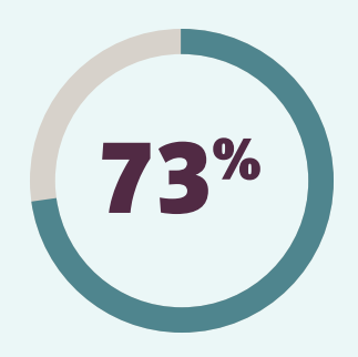
of consumers are confused by medical bills<sup>4</sup>