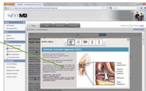
Pop-up links to gain deeper knowledge