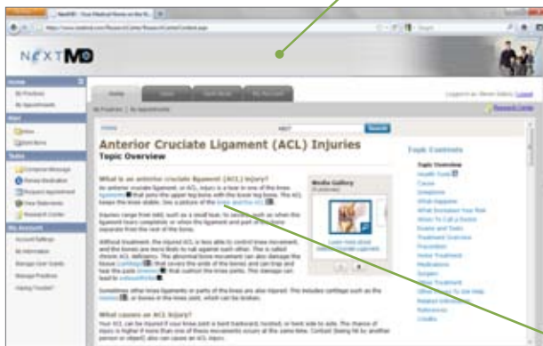
Patient enters Go-To-Web Code through the patient portal.