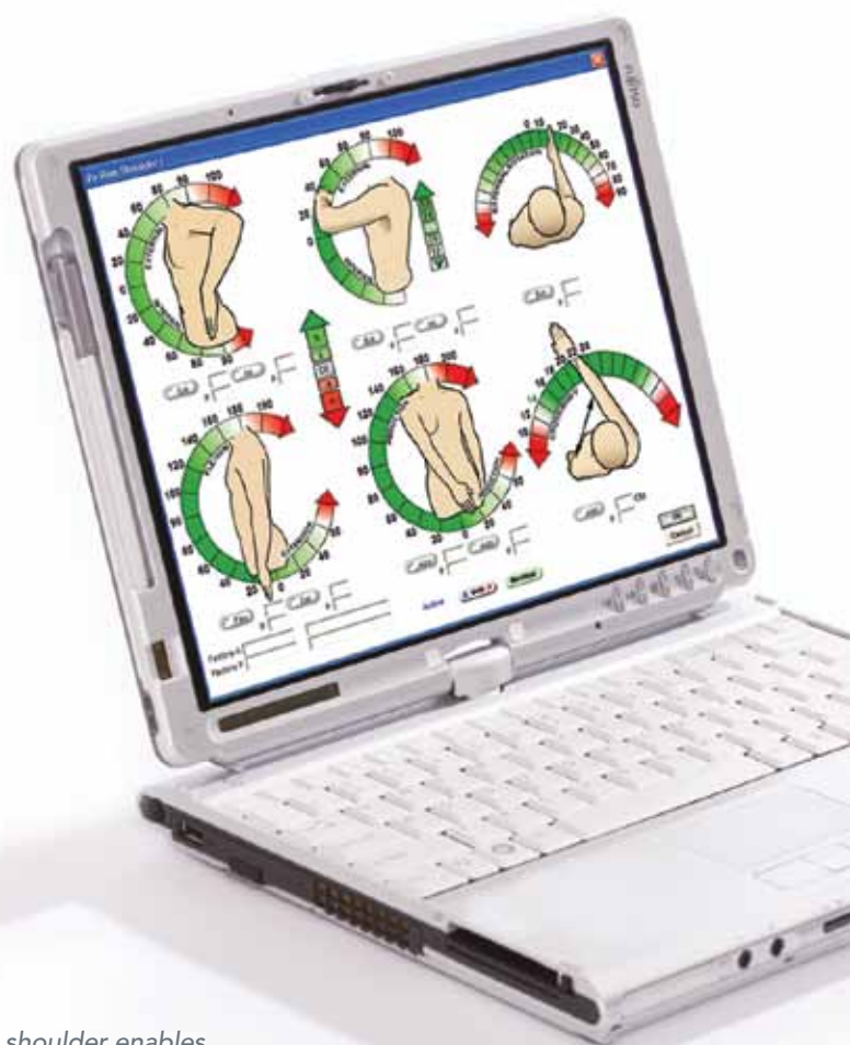
The range of motion template for the shoulder enables fast documentation of specific degrees for a thorough ROM examination