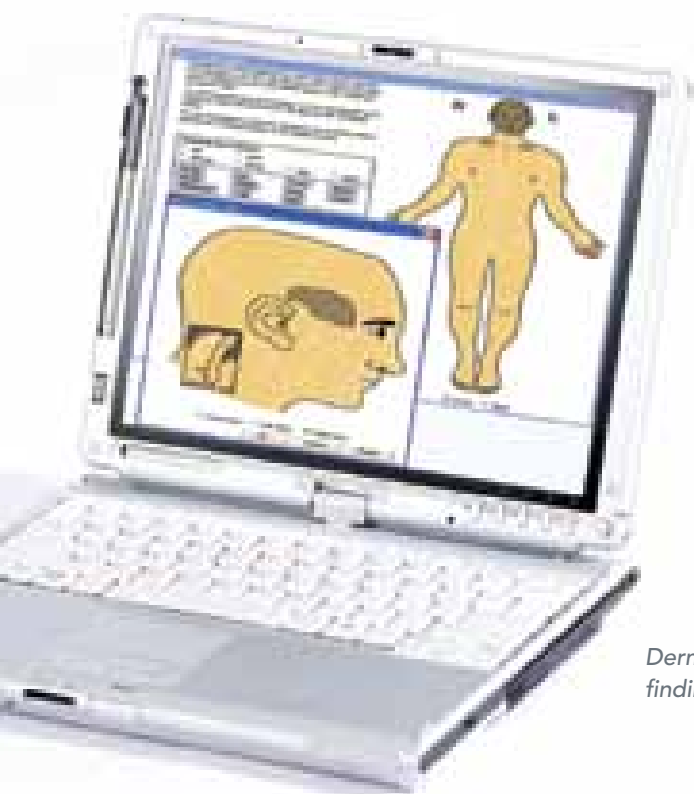
Dermatology graphics: findings selection template